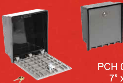
PCH 049 7" x 7"