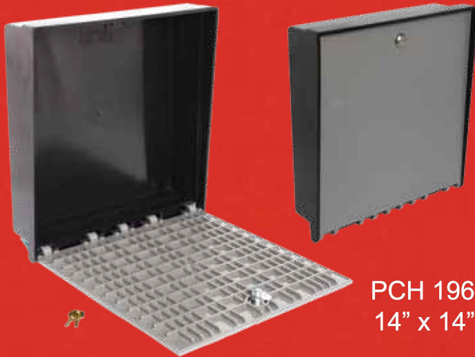
PCH 196 14" x 14"

Three configurations available for any application (7"x7", 7"x13", 14"x14")