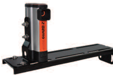
IG2 Mounted on Optional Wall Mount Bracket 1 Ft.L x 2" H x 3" W

We will replace within two years of shipment from our factory, any Invisi-Guard-2 subject to normal use which is found to have defective materials or workmanship, as determined solely by our factory representative. Replacements will be shipped to you freight collect. This warranty is void where evidence of misuse or abuse is present.