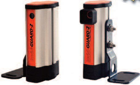
Emitter and Receiver with Universal Adjustable Mounting Brackets

The new contemporary designed IG2 offers a variety of electrical and photo optic configurations available to suit an assortment of applications. The Invisi-guard-2 is suitable for both indoor and outdoor installations.