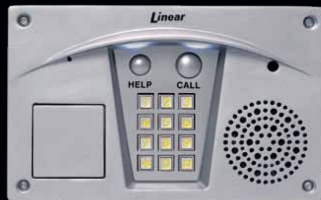
RE-2 STAINLESS STEEL