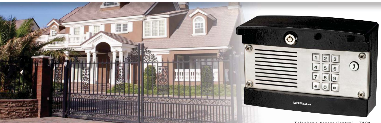
Telephone Access Control – TAC1