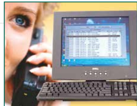
pc programmable easy to use Remote Account Manager software included