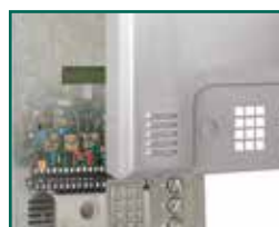
stainless steel plate and anti-vandal features