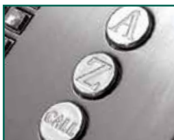
large scroll and call buttons