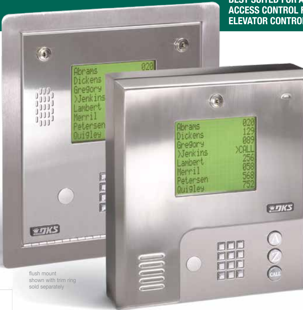
flush mount shown with trim ring sold separately

BEST SUITED FOR APPLICATIONS REQUIRING COMPLETE ACCESS CONTROL FOR UP TO 16 ENTRY POINTS, INCLUDING ELEVATOR CONTROL