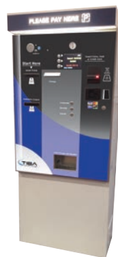
APS-30 Pay Station