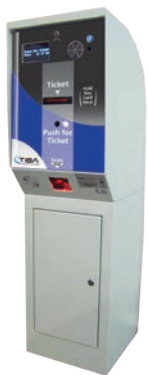
MP-30 Entry Station