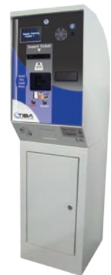
SW-30 Exit Station